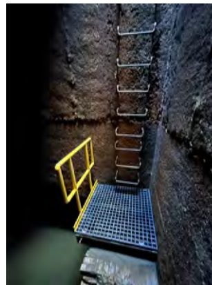
New platform, Special Manhole B.