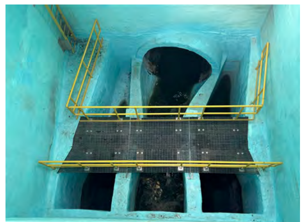
Completed rehabilitation, Special Manhole E.