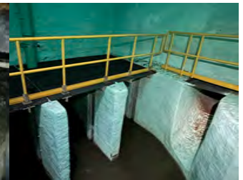
Before and After Rehabilitation, Special Manhole D.