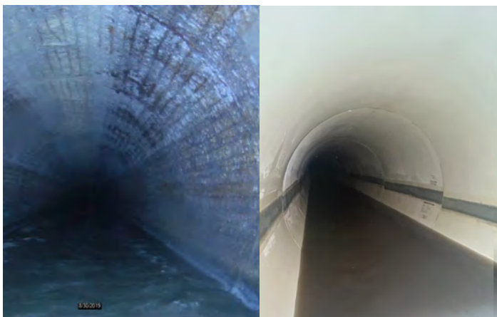
102-Inch New Boston Main Interceptor, Before and After Rehabilitation.